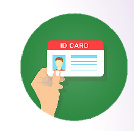
Show your IC or Student ID For Visitor